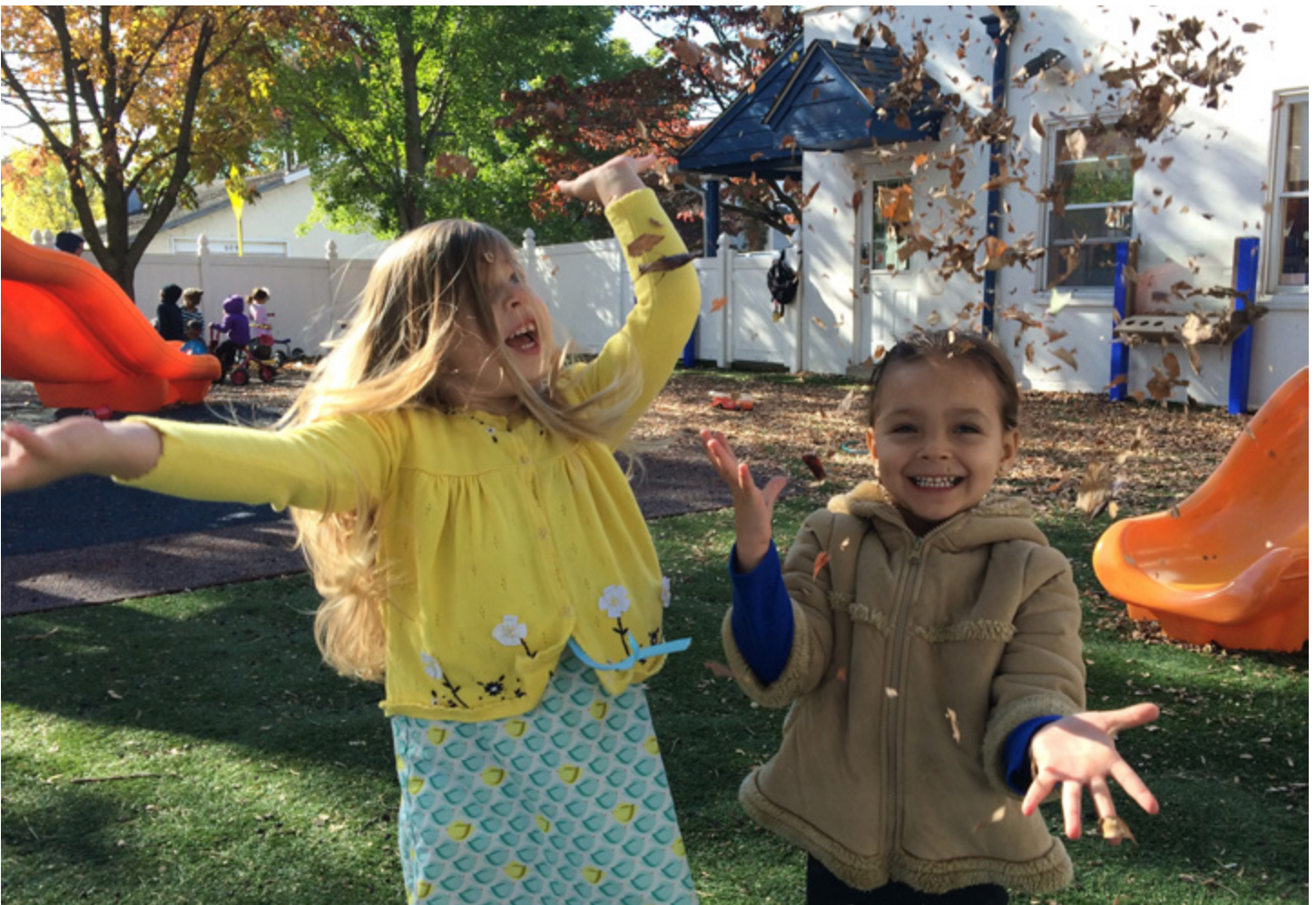
Two children enjoying outdoor play at the West Chester Area Day Care Center.