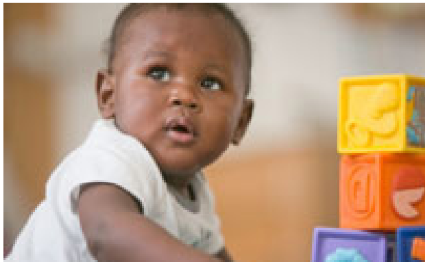
A young child stacks blocks at the Lancaster Early Education Center.

versus low quality childcare is measured by looking at process quality and structural quality (Helburn & Howes, 1996).