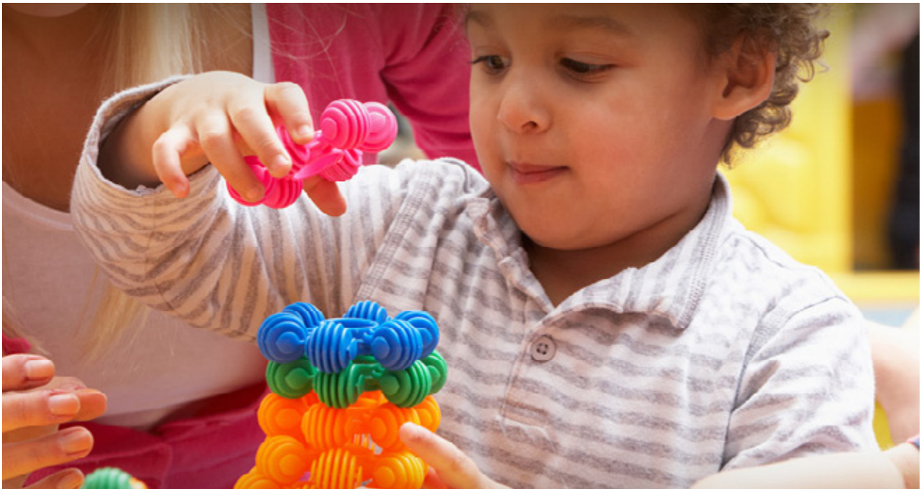
Building a tower helps develop this young child's motor skills and hand-eye coordination.

ZERO TO THREE: National Center for Infants, Toddlers and Families. (2014). Developmental Milestones from Birth to 3. Retrieved from http://www.zerotothree.org/child-development/early-development/developmental-milestones-from.html?referrer=https://www.google.com/