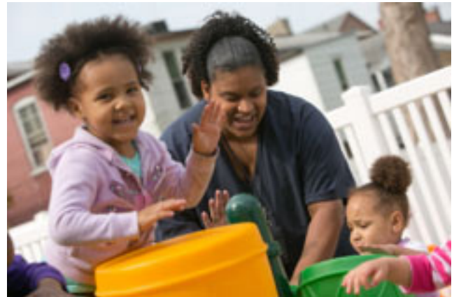
A childcare worker organizes outdoor play at the Lancaster Early Education Center.

These examples name just a few ways states have attempted to manage issues around childcare in their states. In sum, in the absence of a national childcare program, states have acted in varied ways to attempt to meet the needs of families. While other states have shown leadership on these issues, Pennsylvania has lagged behind.