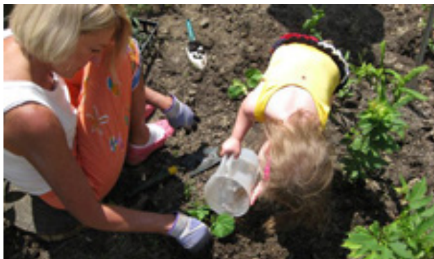
A child helps water plants.

Both the federal Head Start and Early Head Start programs promote school readiness in young children coming from low-income families. They focus on five domains including language and literacy, cognitive and general knowledge, approaches to learning, physical development and health, and social and emotional development (Early Childhood Learning & Knowledge Center, 2015). Nationally in 2013, the Head Start program helped more than 923,000 children and the early head start center assisted 150,100 infants and 6,391 pregnant women. Head Start is administered by the Administration for Children and Families within the Department of Health and Human Services. The program receives approximately $7.2 billion in federal funding, which is given to states and territories to fund these programs (Head Start, 2014). Despite the need, in Pennsylvania between 2014 and 2015 there was a 14.9 percent