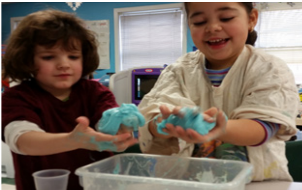
Two children develop their fine motor skills while playing with blue icky, at the West Chester Area Day Care Center.

Pennsylvania also created the program Pre-K Counts, 15 which is a public-private partnership designed to help expand high quality childcare for 3 and 4 year olds (PSEA Education Services Division, 2008). Pre-K Counts offers free, high-quality Pre-Kindergarten that is available for either full or half-day classes. To be eligible, a child must be under 300 percent of the federal poverty level, a language-minority, or demonstrate cultural or special needs (PSEA Education Services Division, 2008). The program is state funded through grants, with Pennsylvania allocating $82.8 M to fund Pre-K Counts programs in 2012-2013 (Pre-K for PA, 2014). The program has over 300 childhood programs and many school districts currently participating (PSEA Education Services Division, 2008).