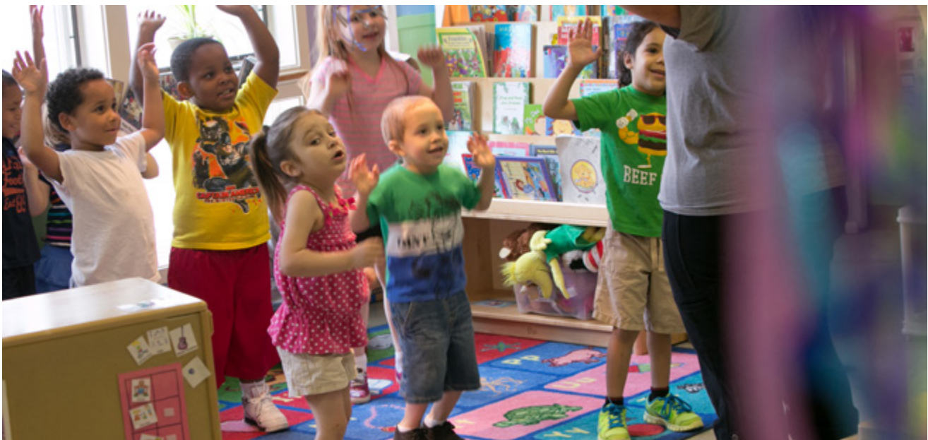
A childcare worker leads a group activity at the Lancaster Early Education Center.

These are just some examples of local Pennsylvania programs that offer childcare to moderate and low-income families. Other options can include having a friend or family member care for the child or receiving non-center care in a person's home. A parent can also remain home with the child, though for financial reasons, this option is not available to many. Yet while a range of local, state, and federal childcare options are available, a number of obstacles may hinder a parent's ability to utilize them, as described in the next section.