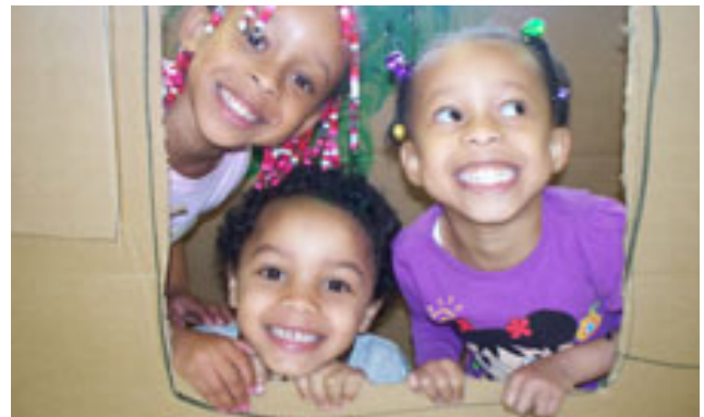
Children play together in a cardboard house.

using their savings to pay for childcare and the 10 percent that reported either removing their children from a formal arrangement, moving closer to relatives, or moving their children to a care center of lesser quality in order to save money (National Association of Childcare Resource & Referral Agencies, 2010).