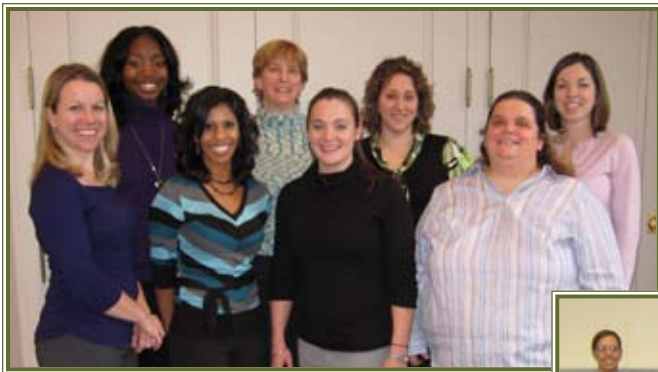
MOT Class of 2009

Every new academic year, the students in the Master of Occupational Therapy program bring something new and different to the table. This year the class of 2010 is over twice the size of the previous year and is comprised of 24 students. A class this big brings a lot of diversity to the program. The variety of the students can be seen geographically and through their educational backgrounds. The class is comprised of individuals from Russia, Alabama, West Virginia, Ohio, Montana, Virginia and Pennsylvania. Their educational backgrounds range from biology, psychology, political