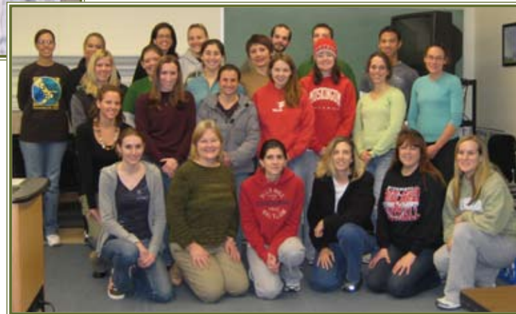
MOT Class of 2010

The class of 2009 is comprised of nine students who are preparing to begin their level II field work commitments in January. Field work sites are spread in location, including Pennsylvania, Tennessee, Ohio, and West Virginia. The class of 2009 may be much smaller in size, but they sure make up for the difference with their big personalities! Some meaningful activities the students from the class of 2009 enjoy are swimming, Zumba aerobics, running, walking, baking, and volunteering. Clearly, the class of 2009 and 2010 are different in many ways. However a common thread that ties us together is our commitment to helping others live life to their fullest and the passion for the occupational therapy profession.