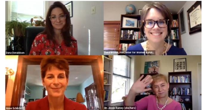
Panel Discussion with Chatham's Centers for Women