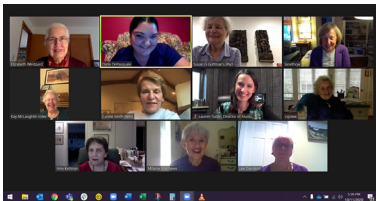
The Class of 1960 reunited for their 60th Reunion Class Party.

chathamalumnireunion.squarespace.com/chatham-university-alumni-awards