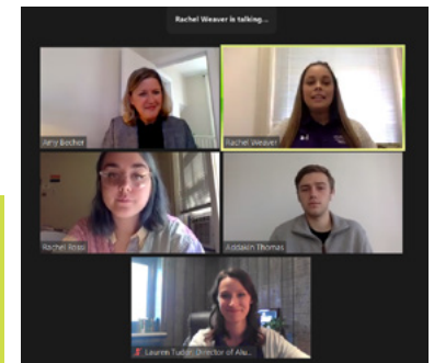
Admissions Update and Student Panel Discussion