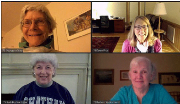
Alumnae from the 1970s meet during a Class Party Breakout Room.