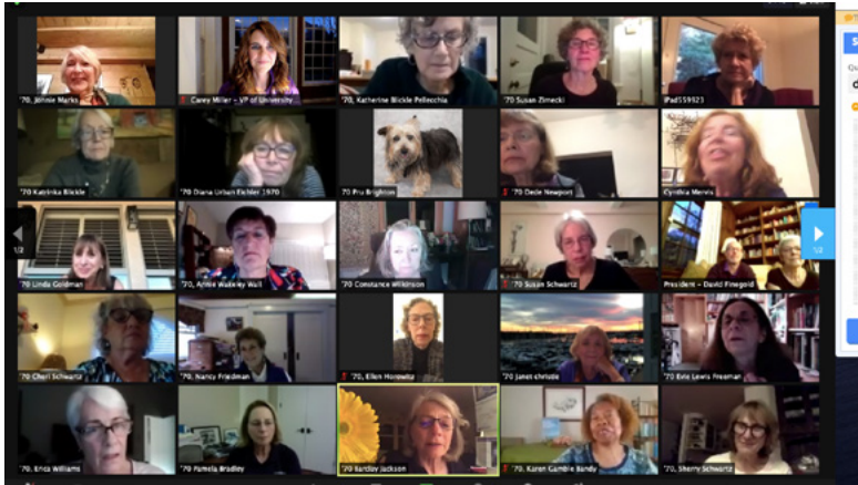
The Class of 1970 reunited for their 50th Reunion Class Party.